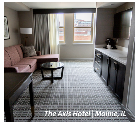
The Axis Hotel | Moline, IL