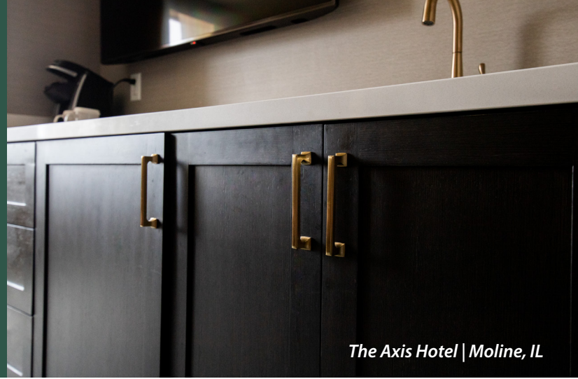
The Axis Hotel | Moline, IL

Partnering with EIS, you can expect a single point of contact, easy-to-read documents, scope consolidation, and turnkey services. Achieving your goals with EIS means gaining extensive value engineering, brand consistency at each location, and quality assurance. We have the knowledge and dedicated resources to consistently serve your hotel brand, from global giants to new emerging concepts.