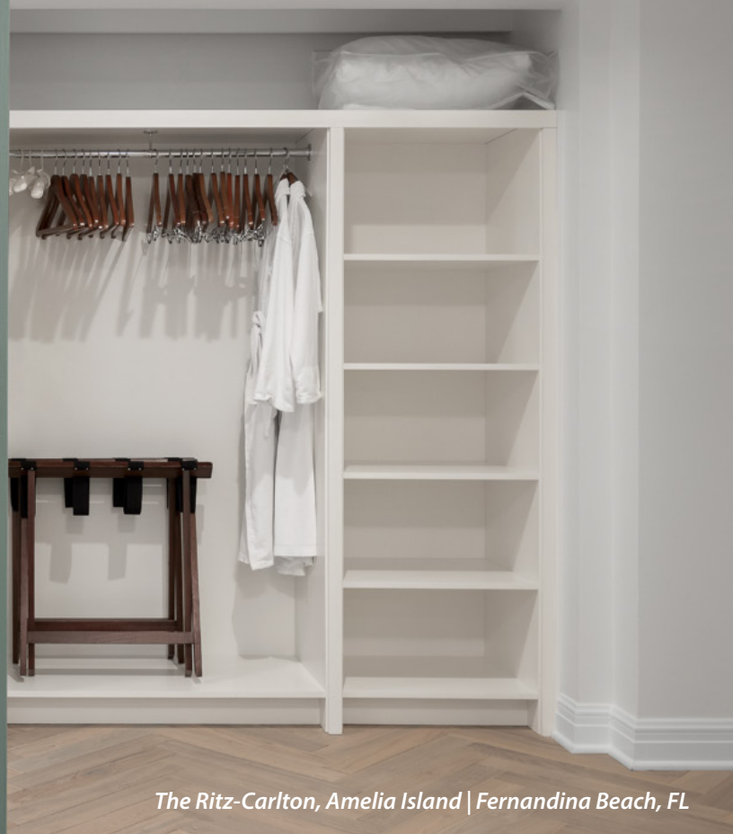
The Ritz-Carlton, Amelia Island | Fernandina Beach, FL

At EIS, we specialize in customizing and simplifying the process for our clients through our deep understanding of hospitality market requirements and well-established strategic approach.