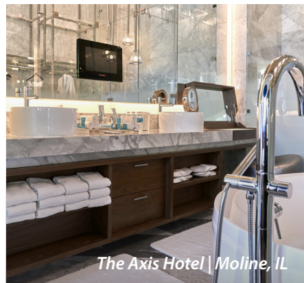
The Axis Hotel | Moline, IL